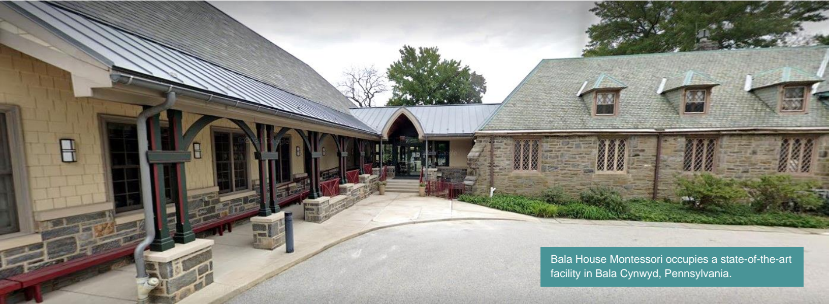
Bala House Montessori occupies a state-of-the-art facility in Bala Cynwyd, Pennsylvania.