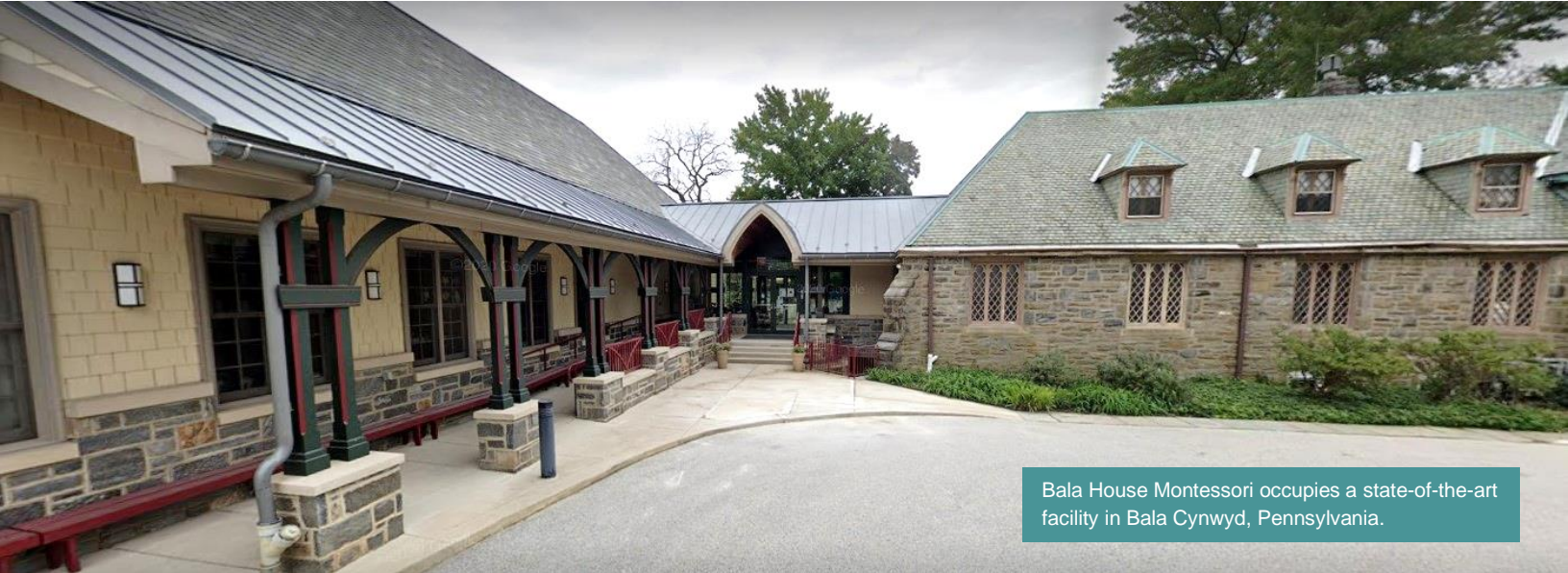
Bala House Montessori occupies a state-of-the-art facility in Bala Cynwyd, Pennsylvania.