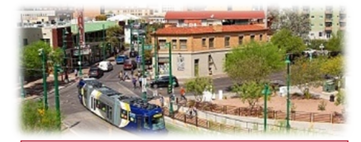
Tucson offers a unique <u>streetcar</u> that can transport passengers between its districts.