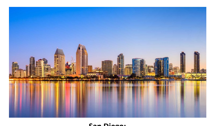
San Diego: San Diego Chamber of Commerce: https://sdchamber.org/

Few places in the world can match the character and culture of Southern California. Visitors and residents alike find world-class entertainment, professional sports teams, award-winning museums and cultural centers, expansive beaches, national parks, striking architecture, beautiful weather and limitless options for dining, shopping and outdoor recreation. Southern California residents can access ski areas and beaches, museums and shopping, fine dining and festivals, theme parks and the symphony all in the same weekend. To learn more about Southern California and San Diego, Los Angeles, Pasadena, and Anaheim, visit: