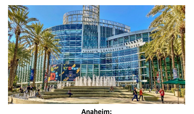
Visit Anaheim: https://www.visitanaheim.org/