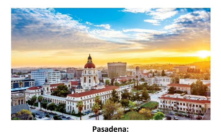
City of Pasadena: https://www.cityofpasadena.net/