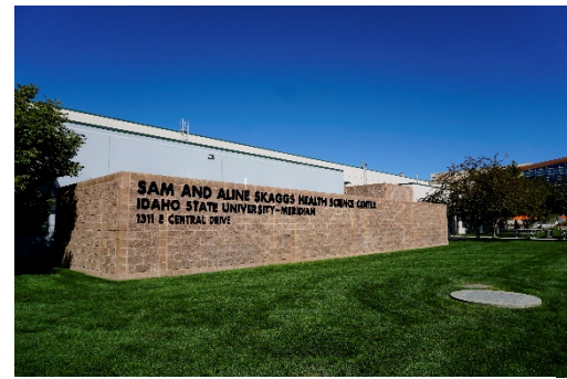
ISU Meridian Health Science Center, Meridian