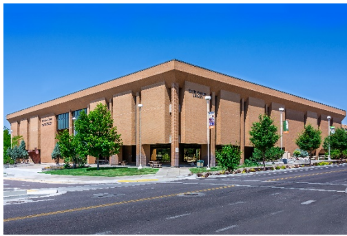
Eli M. Oboler Library, Pocatello