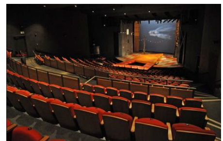
Lincoln Performance Hall