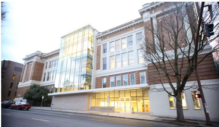
Built in 1911, Lincoln Hall (1620 SW Park Ave.) was Portland State University's first home. The historic building was renovated in 2013 and is now LEED Platinum certified. Lincoln Hall houses the Office of the Dean, the School of Music, and the School of Theater + Film

The units within the College are located in six buildings across the campus and facilities include classrooms, studio spaces, five computer labs, several materials labs, three galleries, four unit performance spaces of various sizes and a 465-seat performance hall run by the Dean's office and used by Theatre & Film, Music and over 40 community partners. The College provides a large number of exhibits, lectures, performances and symposiums open to the public and functions as a physical as well as a cultural gateway to the University. The College has a mix of traditional, returning and continuing students and provides courses for a large number of non-majors in the University. Students gain valuable experience interacting with arts organizations, professional companies and creative/commercial entities in the community through both coursework and internships.