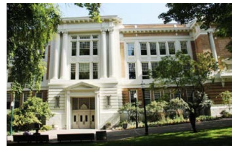
School of Music