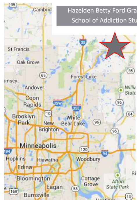
Hazelden Betty Ford Graduate School of Addiction Studies

Chisago, the name of the county, comes from the Chippewa Indian word, Ki-Chi-Saga, which means Fair and Lovely Lakes. Center City became the county seat in 1875 and was the first permanent Swedish settlement in Minnesota. During the past two decades Chisago County has been one of the faster growing counties in Minnesota. Easy access from Minneapolis and St. Paul, the natural scenic beauty of the St. Croix River and its local lakes make the county a great place to visit and live.