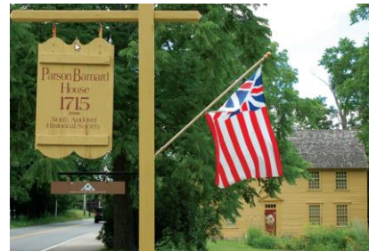
The Parson Barnard House (1715)