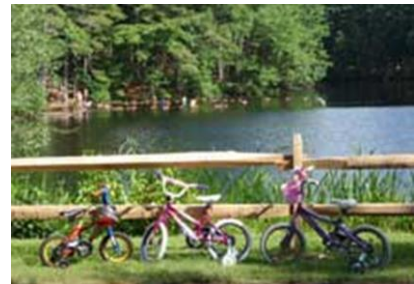
Harold Parker State Forest

North Andover is a quintessential New England town that is not only rich in history with its museums and historic places of interest but also offers over 3,000 acres of open space, farmland and farms (open to the public), with many avenues to appreciate nature. It features walking trails, ponds, a state forest and park, and hiking hills